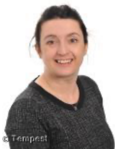
Class Teacher EYFS Co-ordinator