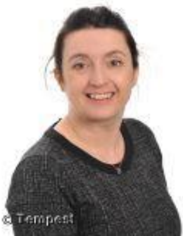
Class Teacher EYFS Co-ordinator