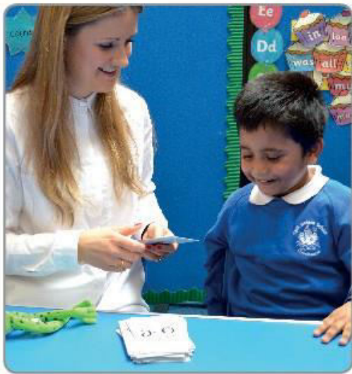
Learning the Speed Sounds in the classroom.